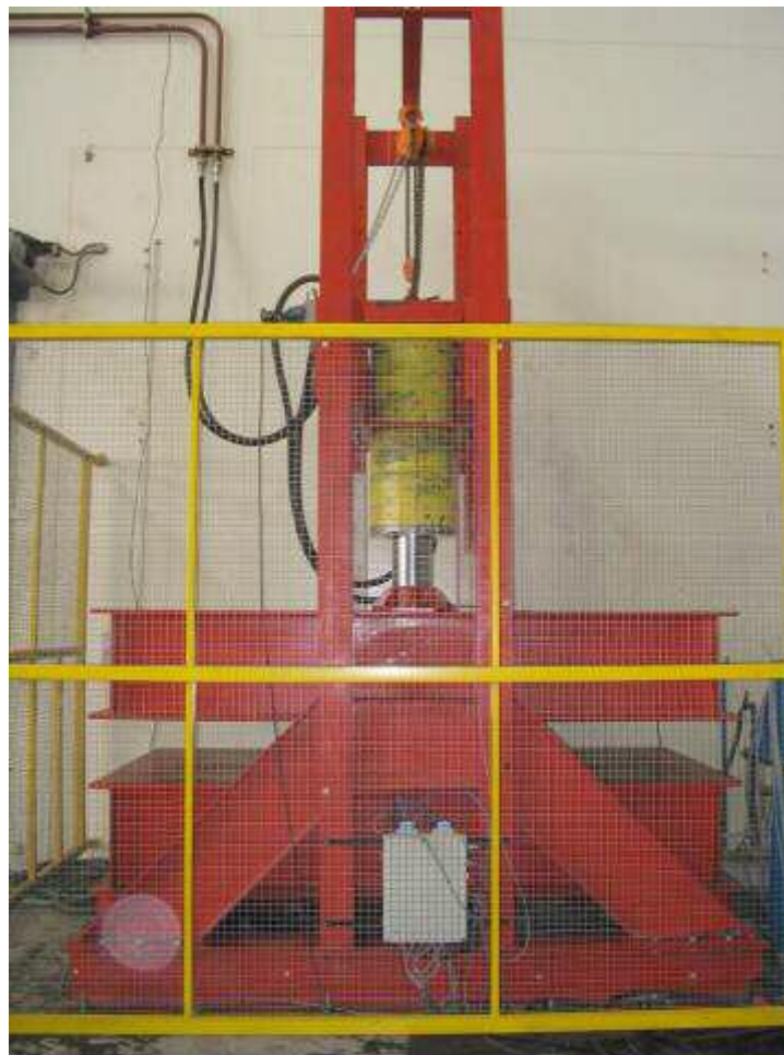
Figure 1: Test Frame

The test was done in a 1400 kN Static test frame. The load was measured using four 10kN HBM S9 load cells. The four load cells were fixed to a load plate and the data sampled simultaneously. Data acquisition and signal conditioning was done with a HBM Spider8-30 and sampled with a lap top computer running Catman 3.0 software.