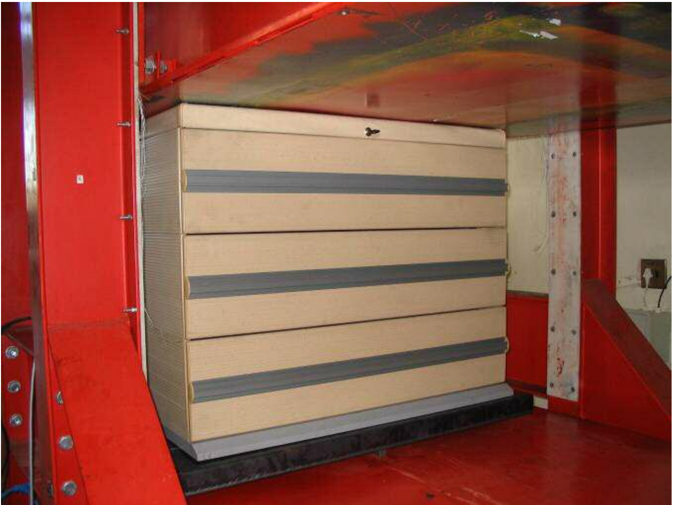
Figure 2: Orgafire Cabinet fitted in the test frame