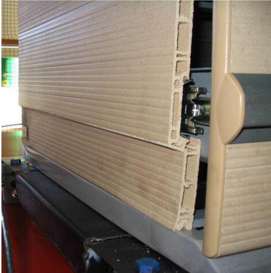
Figure 4: Failure of the side panel.